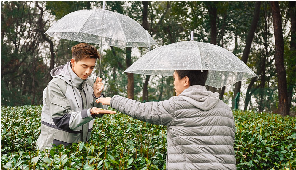
Figure 1. “Run away from home”-Movie star Li Xian stayed at a tea plantation homestay in Hangzhou ( https://www.mafengwo.cn/gonglve/ziyouxing/264982.html )

Airbnb-48 Hours Enough to Play's photos: